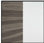
Aged Walnut/Extraclear Glass