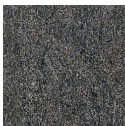
Basalt grey (CA)