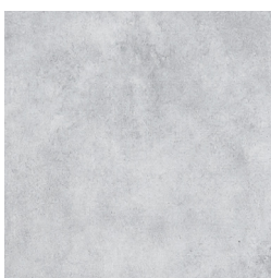
Concrete grey (CB)