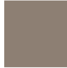
55 Mineral Grey Grigio Minerale