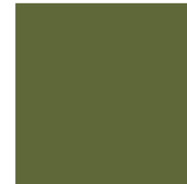
25 Olive Green Verde Oliva